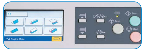
4.3" Color Touchscreen LCD Control Panel