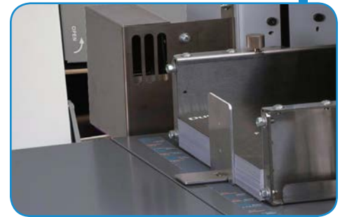
Side Air System: Enhances feeding of heavy stock and large paper sizes