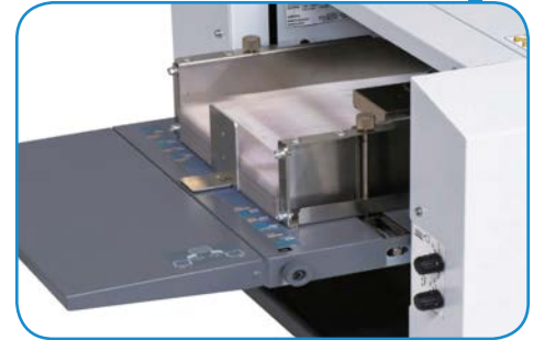
Air Suction Feeder: Uses both optical and ultrasonic sensors to ensure one sheet is fed at a time