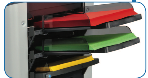
Easy to load document feeders