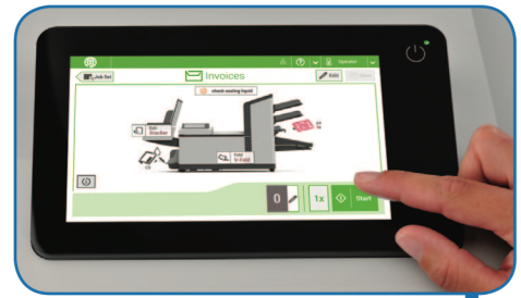
Full-color 7" touchscreen control panel with graphical interface and paper /envelope presence sensors

* Speed and Duty Cycle with optional Productivity Package. Paper & envelope specifications may vary. All media must be tested.