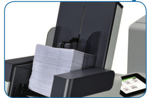
High-Capacity Vertical Stacker holds up to 500 filled envelopes