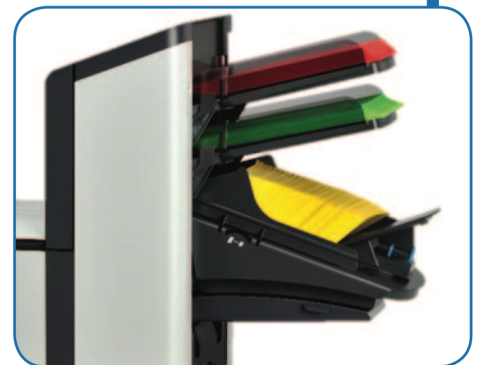
Optional Production Feeder holds up to 325 BREs or 1,200 inserts up to 6" in length