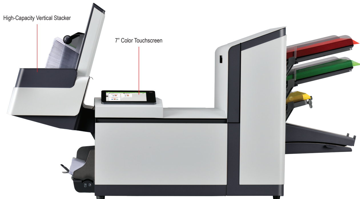
FD 6210-Advanced 2 with new standard High-Capacity Vertical Output Stacker