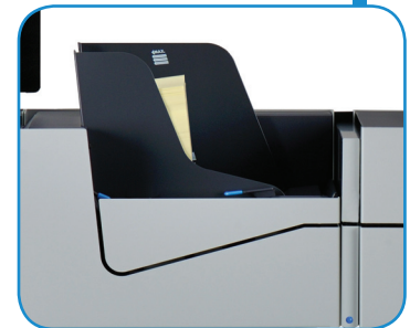
Thin Booklet Feeder