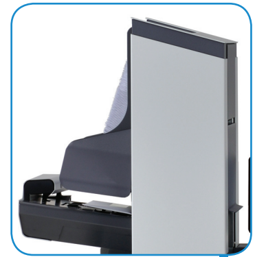
High-Capacity Vertical Output Stacker

** Bottom-address documents can be processed only in Half and Z-fold modes, up to 5 sheets.