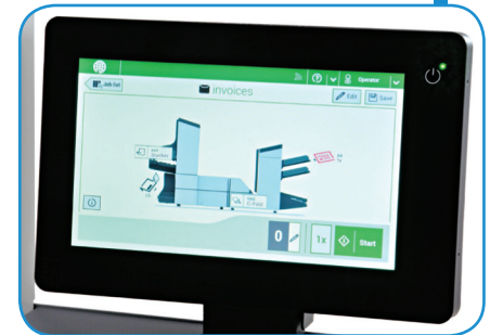
Color Touchscreen Control with Paper Presence Sensors & Graphical On-Screen Display